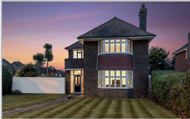
Marine Drive Worthing BN12 4QN